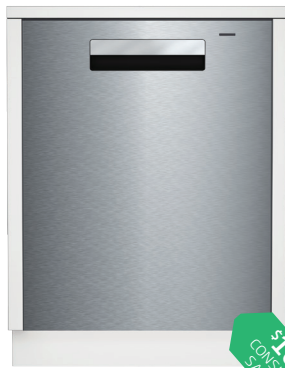
Integrated Handle Dishwashers