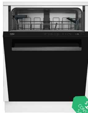
Square Handle Dishwashers