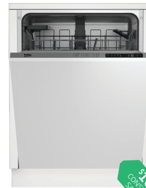
Panel Ready Dishwashers